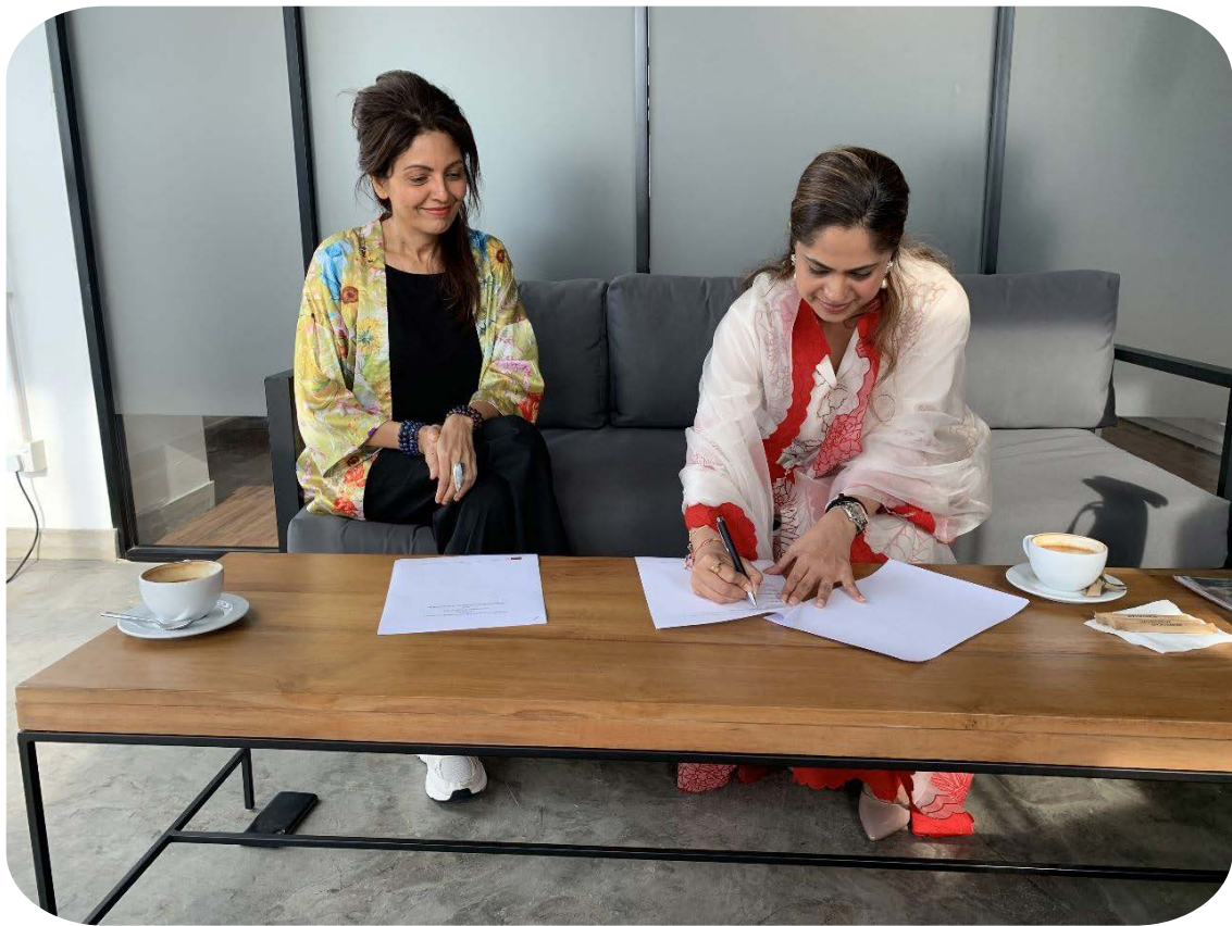
MoU signed with Design for Sustainable Development Foundation (DFSD)