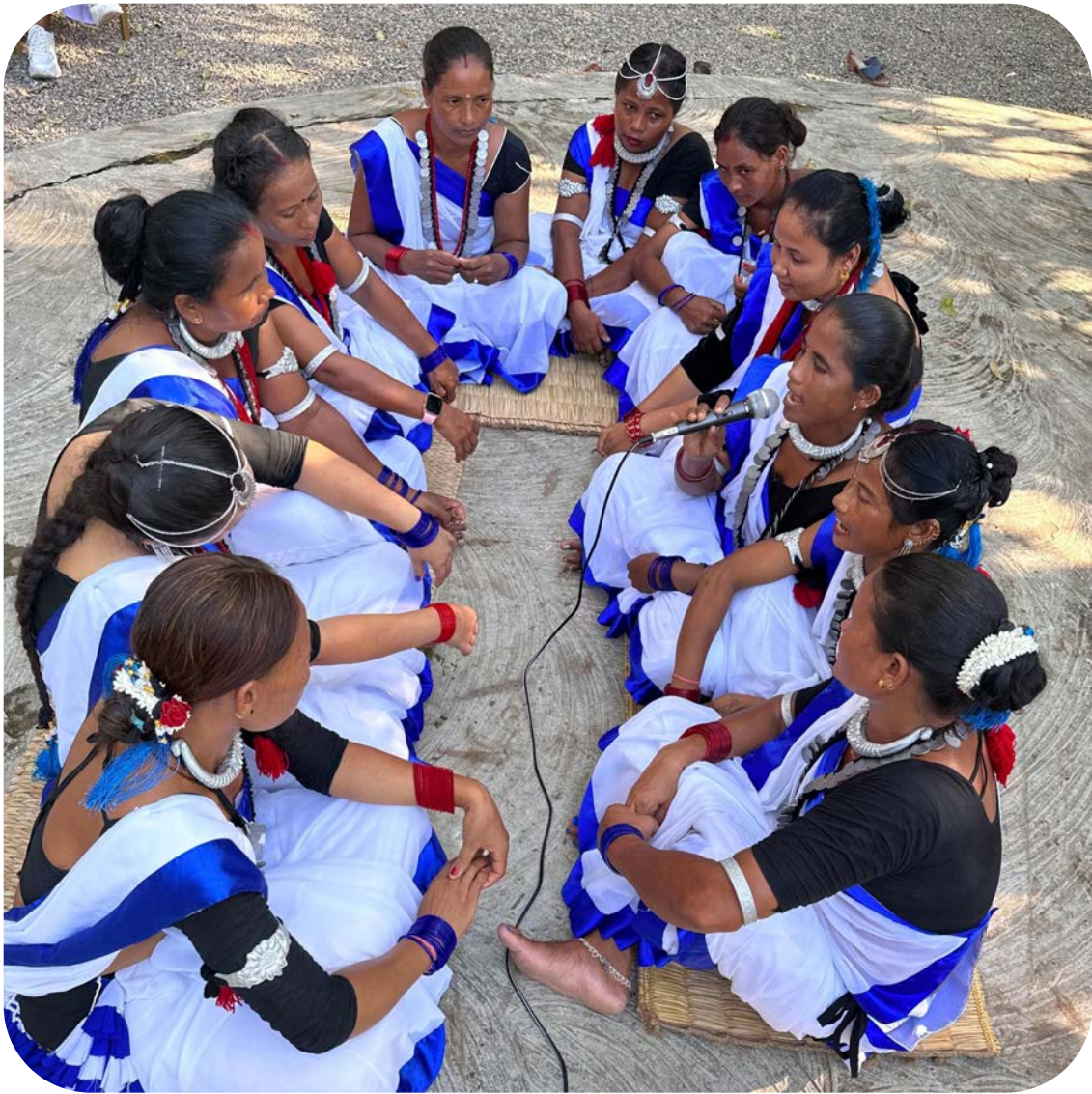
Promoting Teej & Jitiya festival in Unnati Cultural Village (UCV)