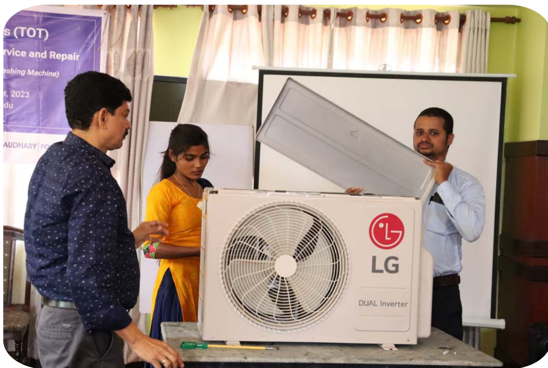
Traning of Trainers (TOT) on Electrical Appliances, Service and Repair