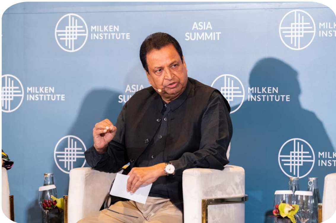
Participation of our Chair in 10th Asia Summit 2023