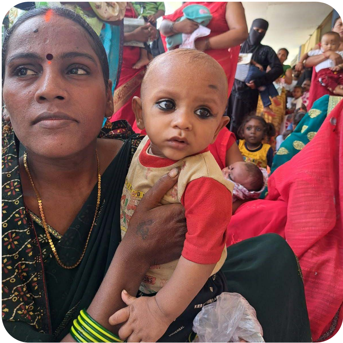
Breastfeeding Week Celebration in Palkihawa Health Post