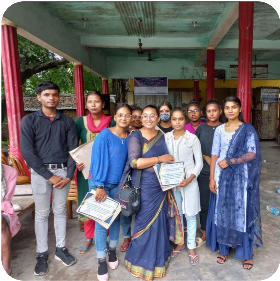
76 Students Graduated on 6 months course of Electrical and Mechanical