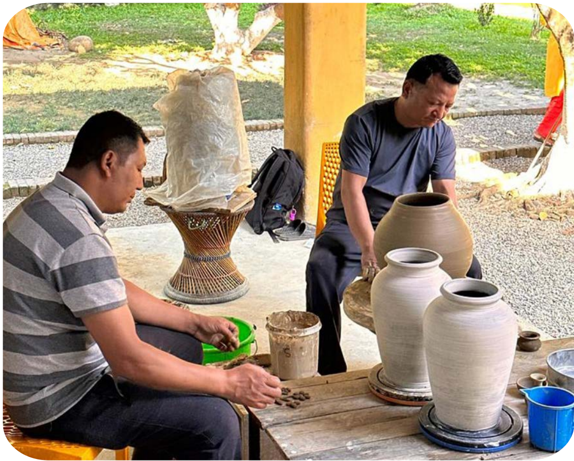
Ceramic and Pottery Residency