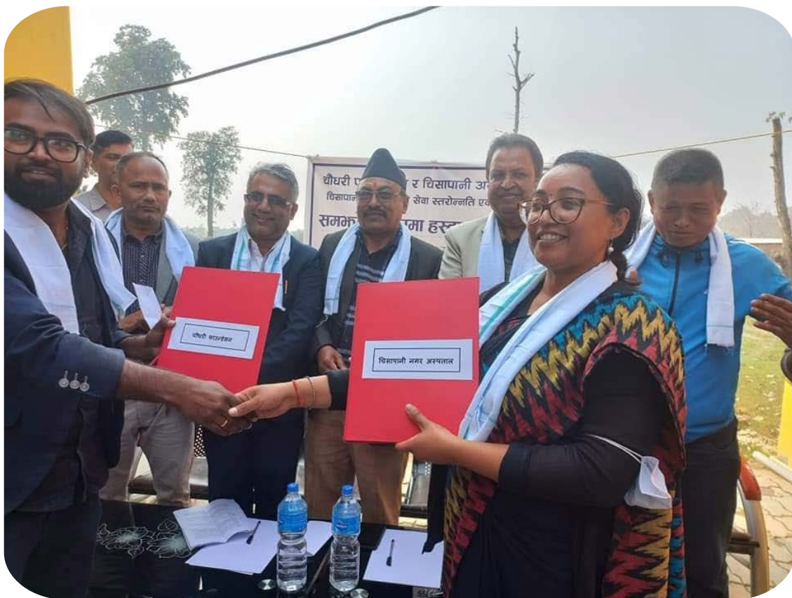
MoU with Chisapani Hospital to Strengthen the Overall Operation of Hospital