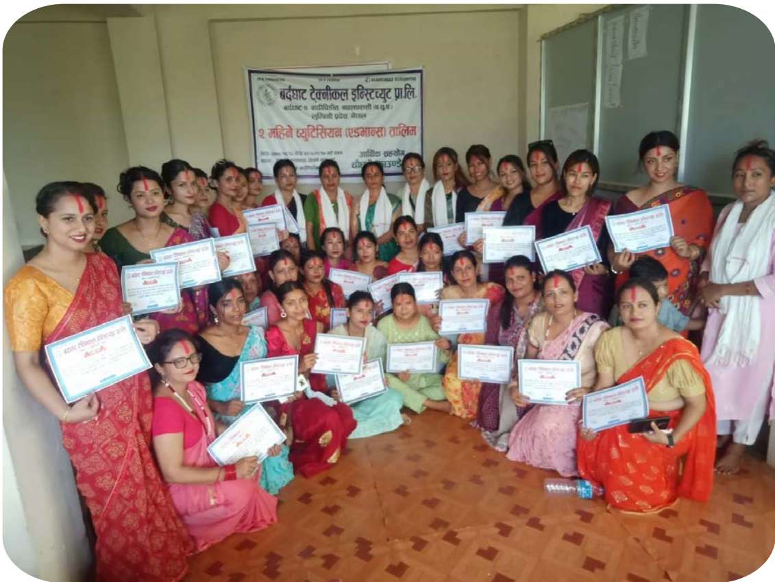
70 Womens Trained from Beautician Training