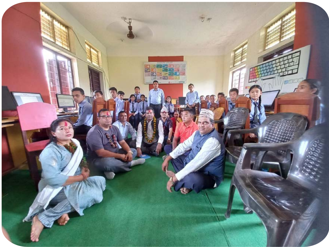
Monitoring and Evaluation Visit by Social Welfare Council