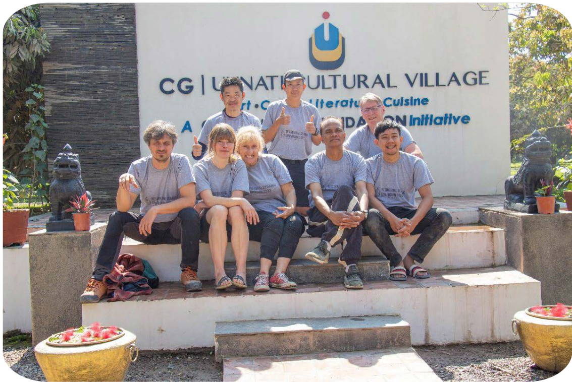
Ceramics Symposium Program