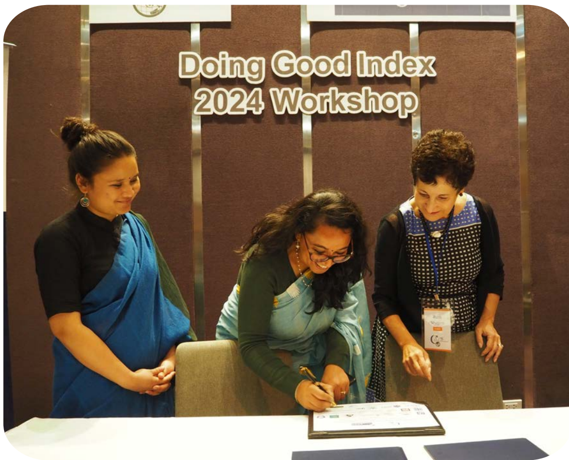
Participation in DGI 2024 Workshop