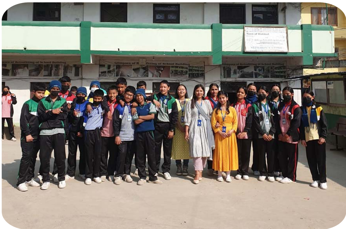
BSW Students conducted Workshop on Cyberbullying