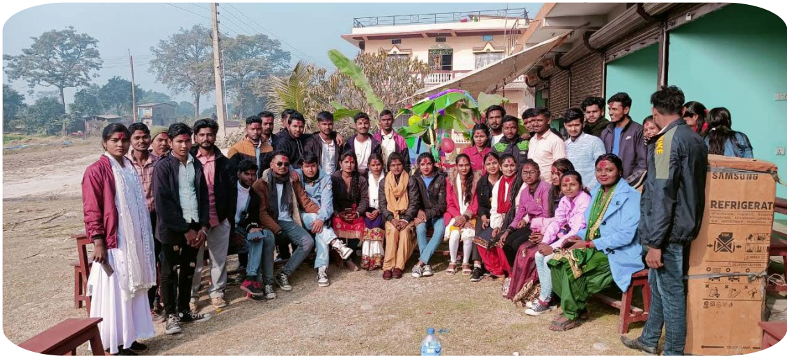
Initiation of Polytechnic Training - Mechanical and Electrical