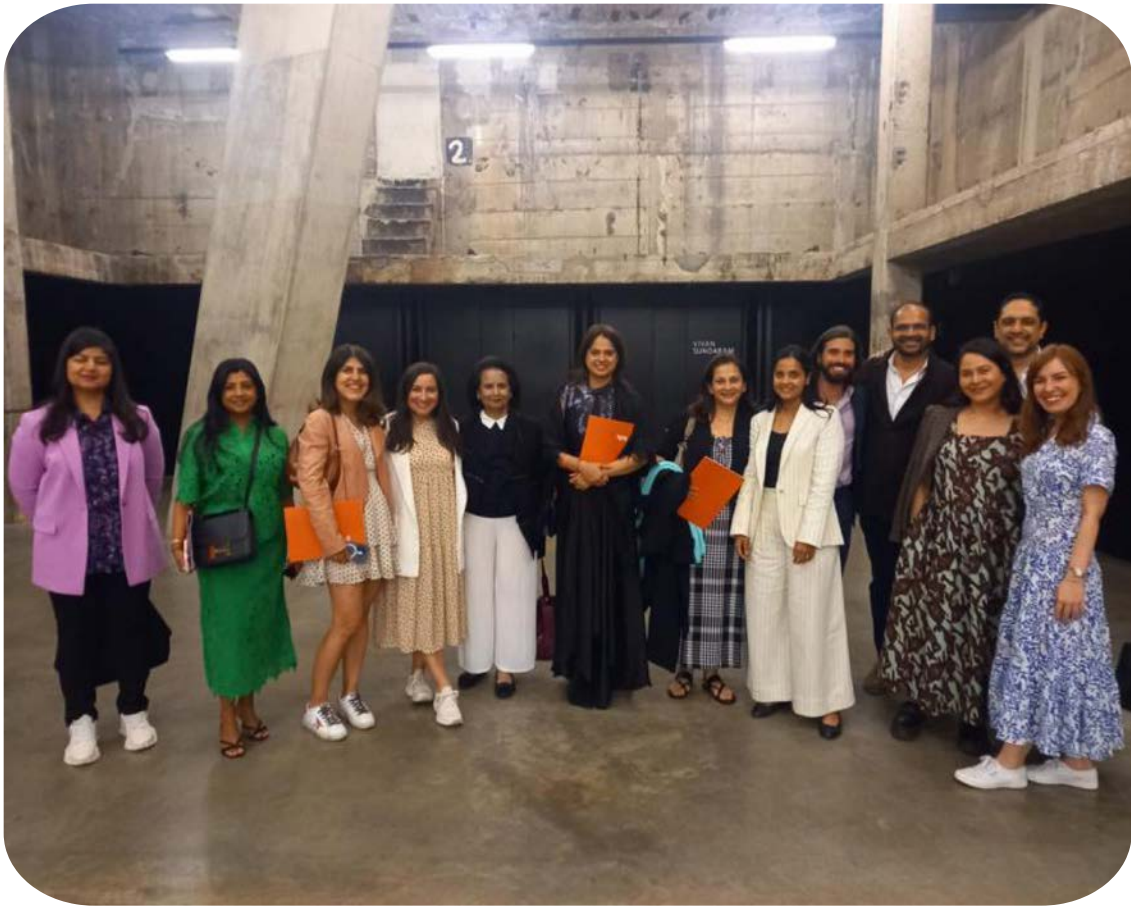
Our Founding Director appointed as Nepal's representative and a member of Tate Modern's South Asian Acquisitions Committee