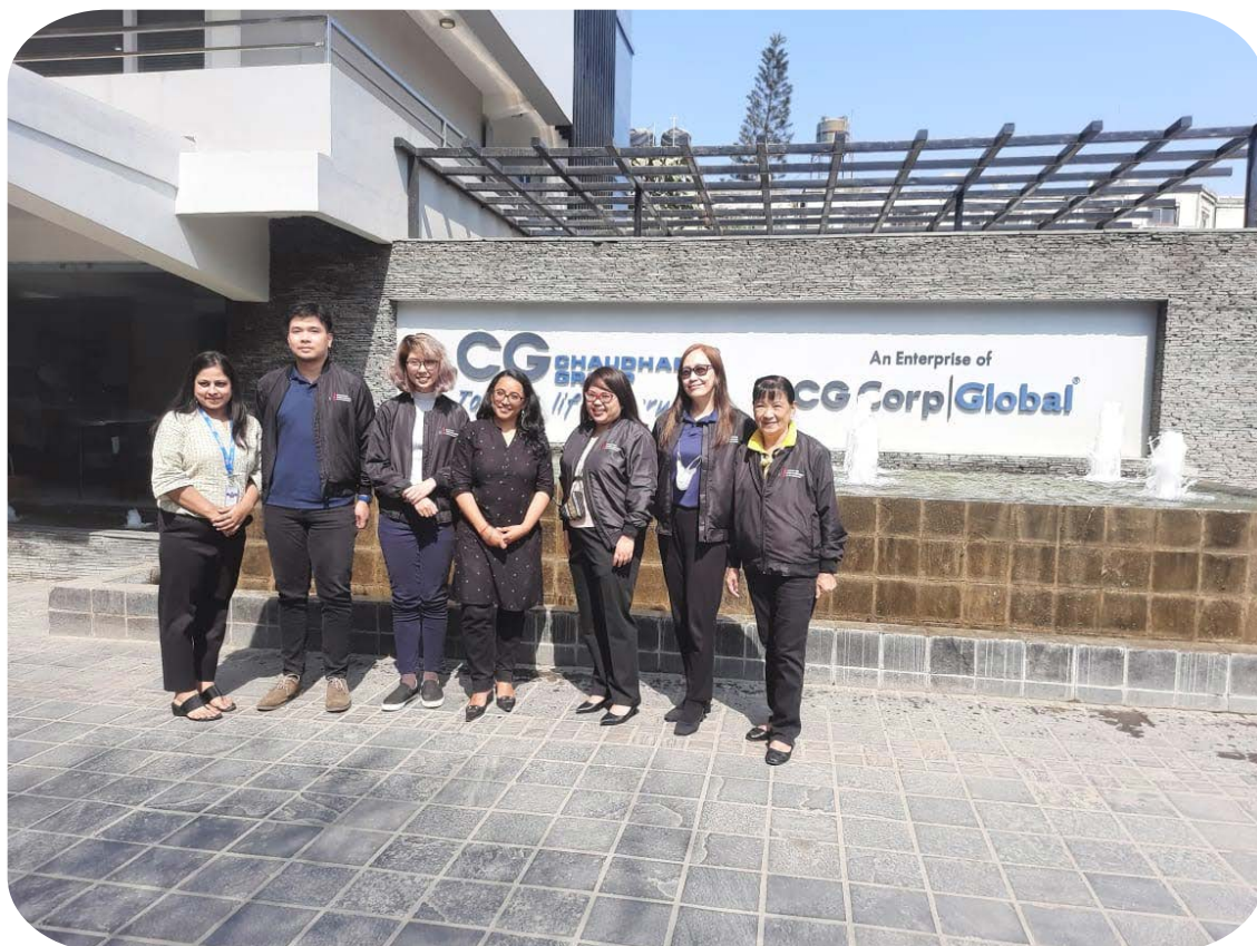
Philippines Preparedness Team Visited Chaudhary Foundation