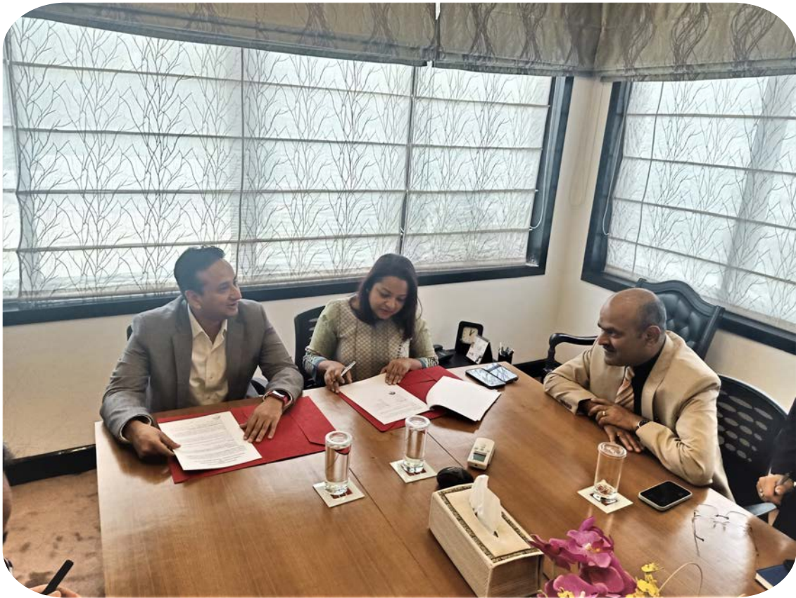
MoU Signed with Norvic Hospital to Strengthen the Chispapani Hospital Services