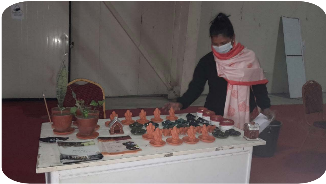
Reflection on the year 2023