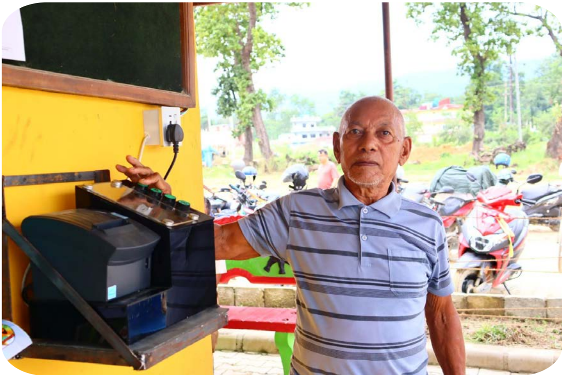
Digital Token System Installation Support in Chispapani Hospital