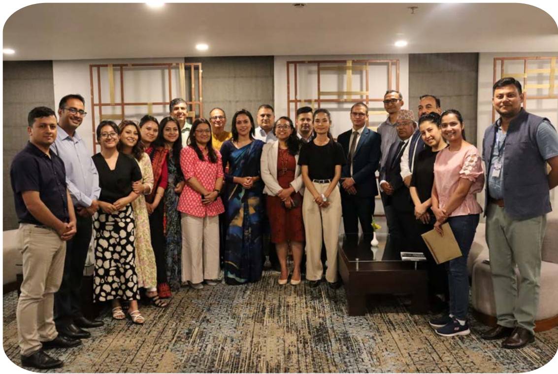
Doing Good Index 2024 Experts Meet