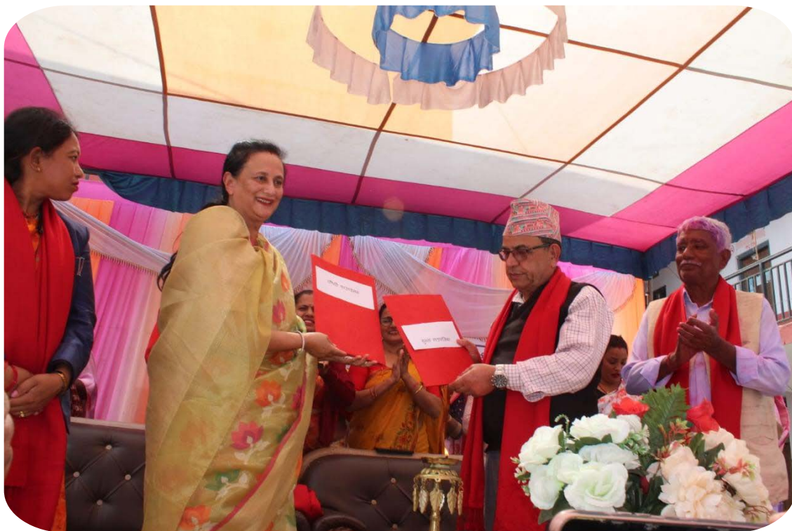
MoU With Susta Municipality to Upgrade Paklihawa Birthing Center