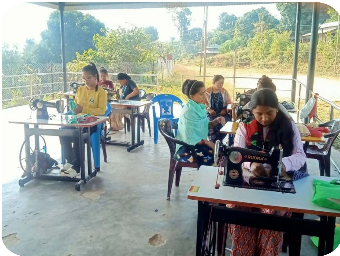
Empowering Women Through Sewing Training in Sukhaura, Nawarparasi