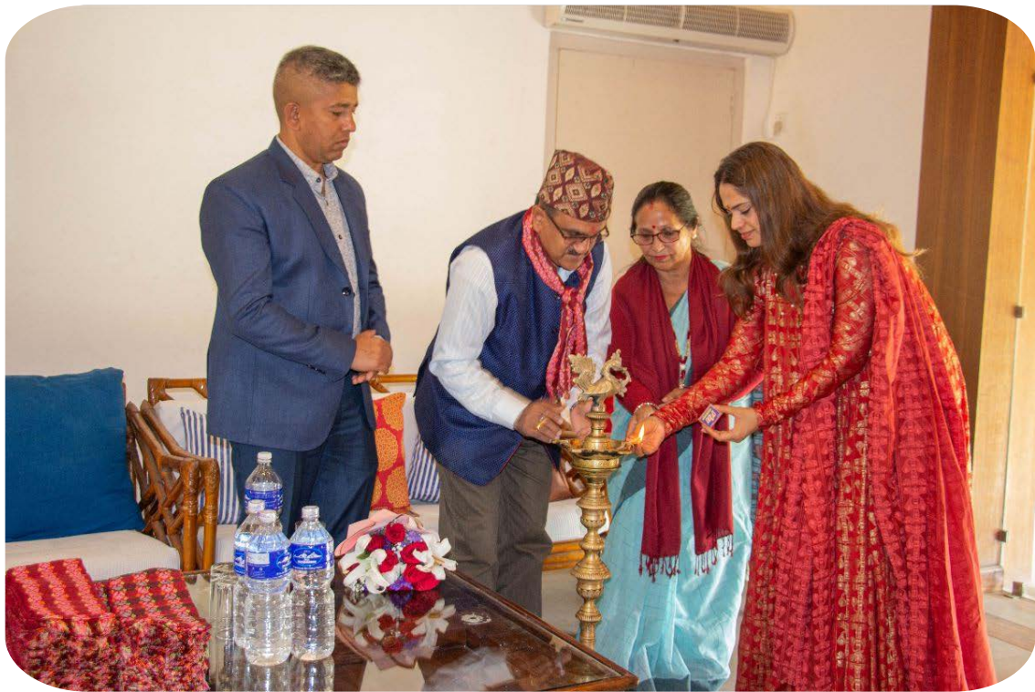
Unnati Mela : Promoting Art and Craft