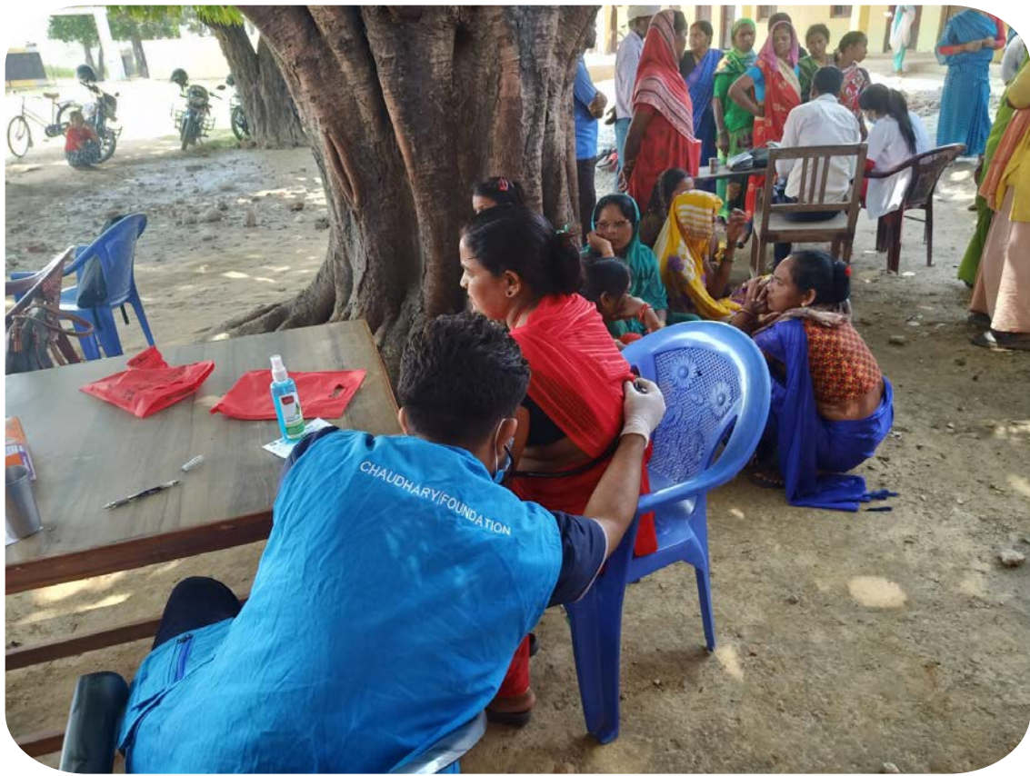
683 women benefitted from Women Health Camp