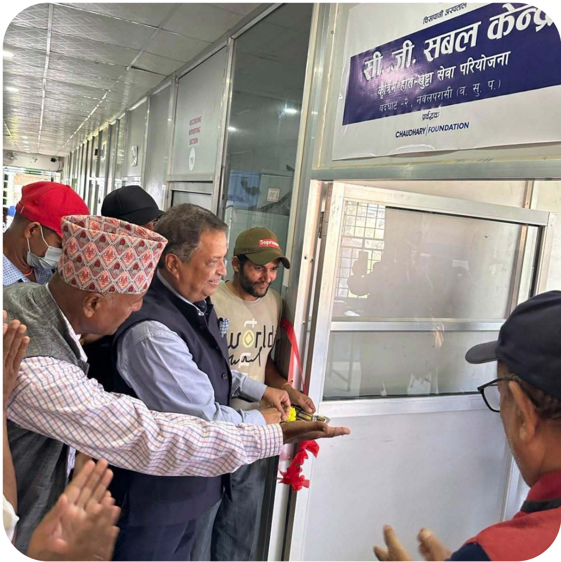
Inauguration of Sabal Center (Free Limb Fitment Services) in Chisapani Hospital