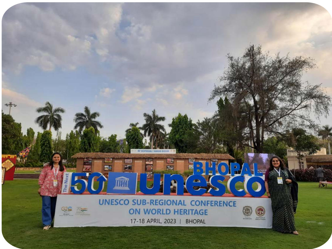
Participation at UNESCO SUB-REGIONAL CONFERENCE on World Heritage