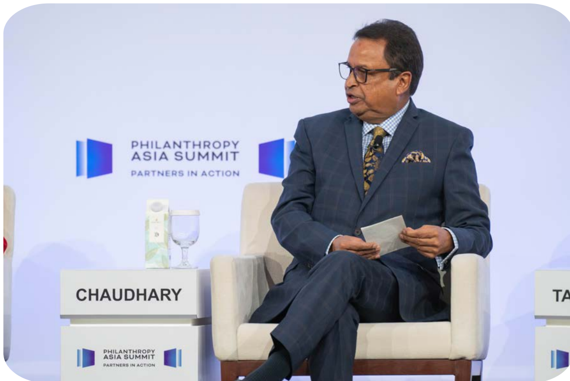
Participation of our Chair in Philanthropy Asia Summit