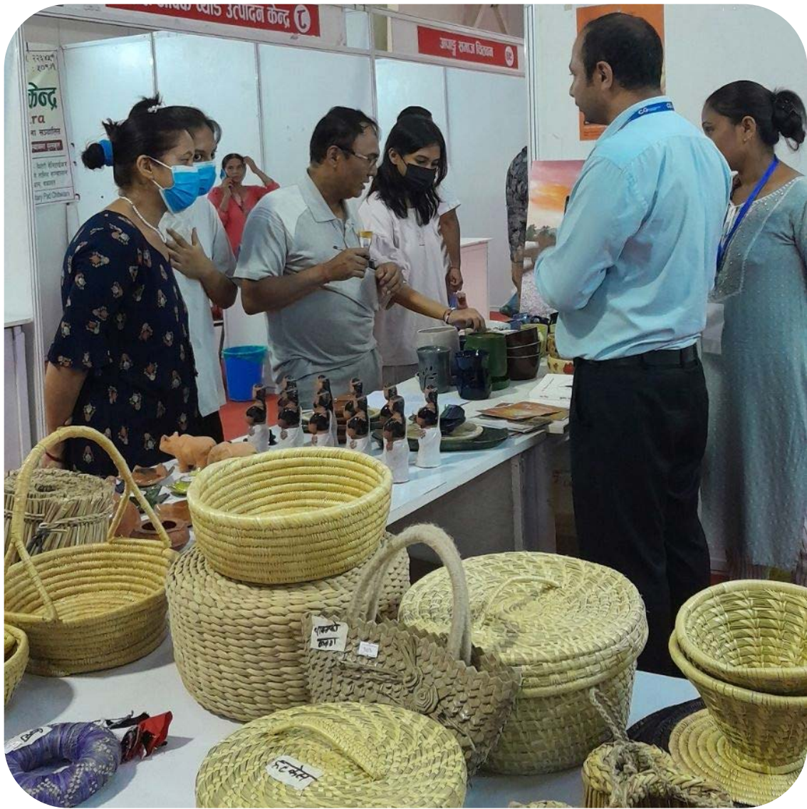
Entrepreneur Expo & Summit in Chitwan