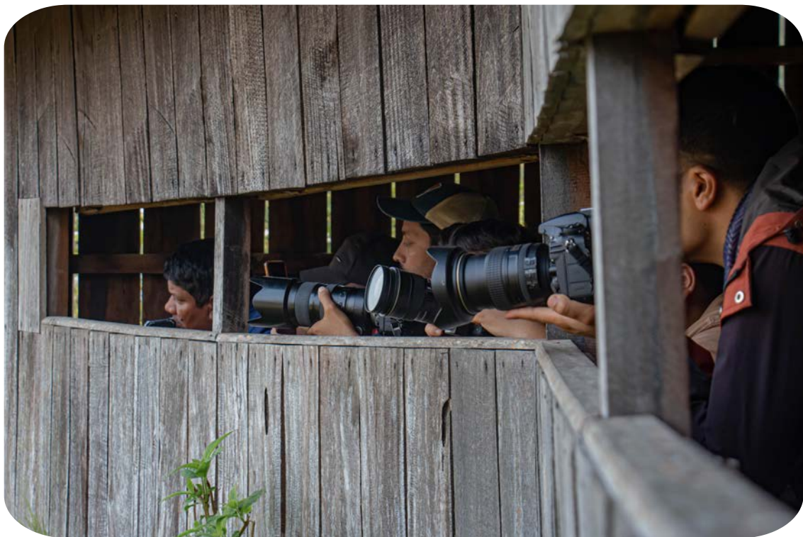
Nawalpur Residency Program