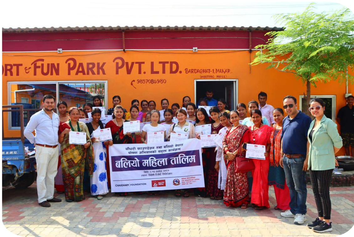
Baliyo Mahila Training : Empowering Women Entrepreneurs