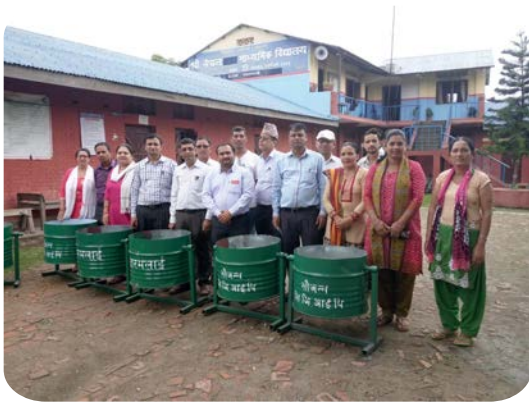
E - Waste Management