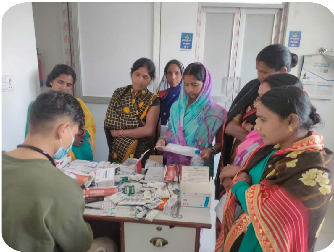
Maternal Health Camp in Nawalparasi