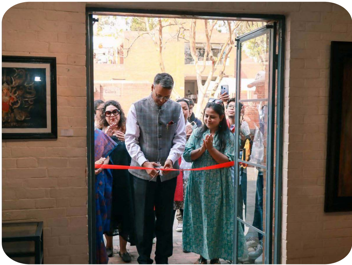
Bharat Nepal Kala Sangram