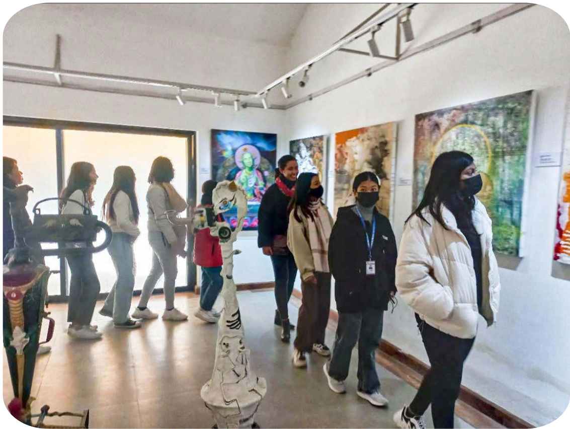
School and College tour to Unnati Cultural Village (UCV)