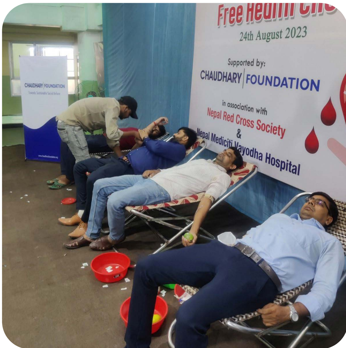
Blood Donation & Free Health Checkup