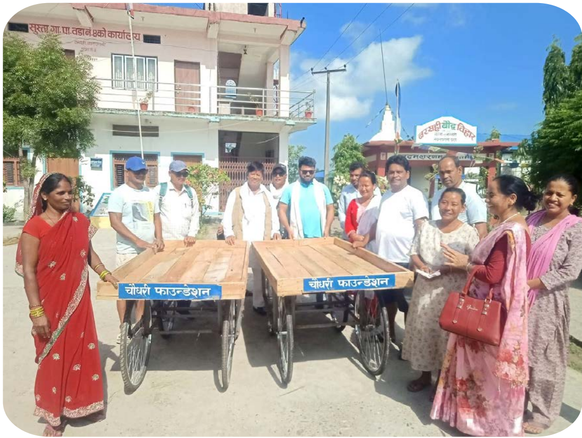
Cart Wheel Distribution