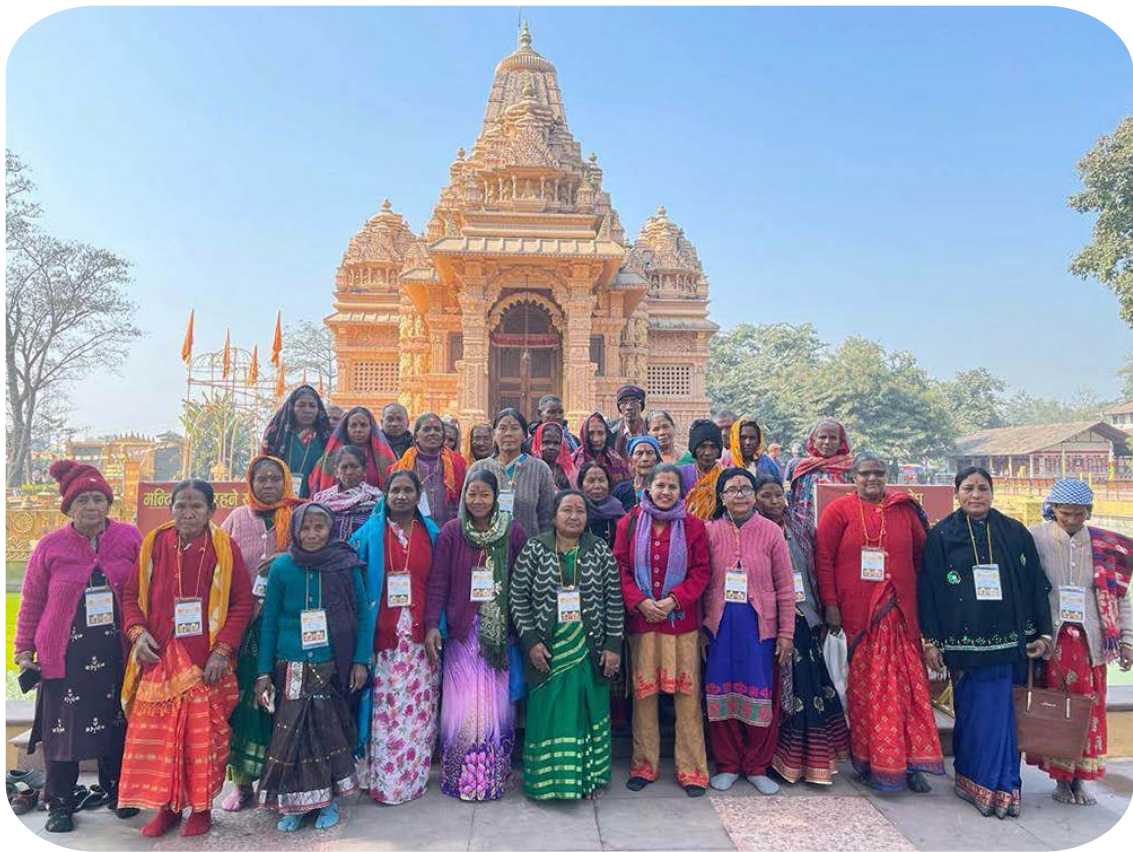
Elderly visit to Shashwat Dham