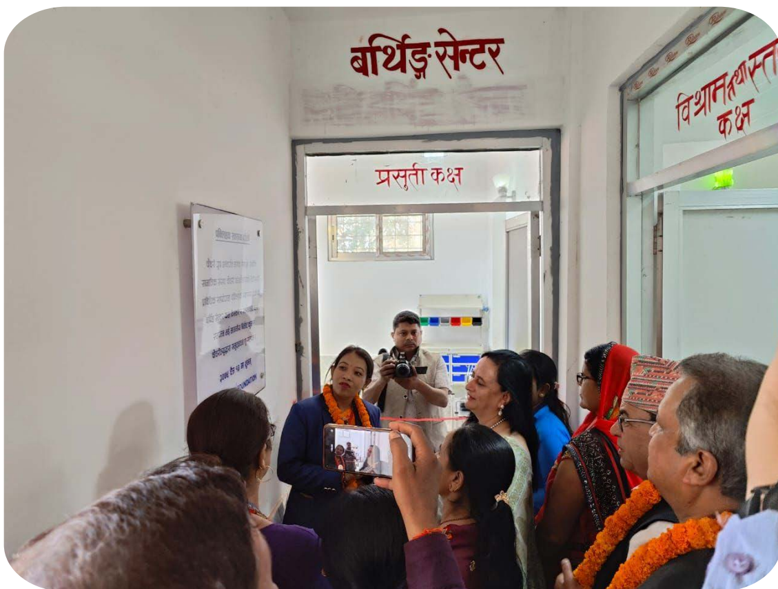
Inauguration of Paklihawa Birthing Center